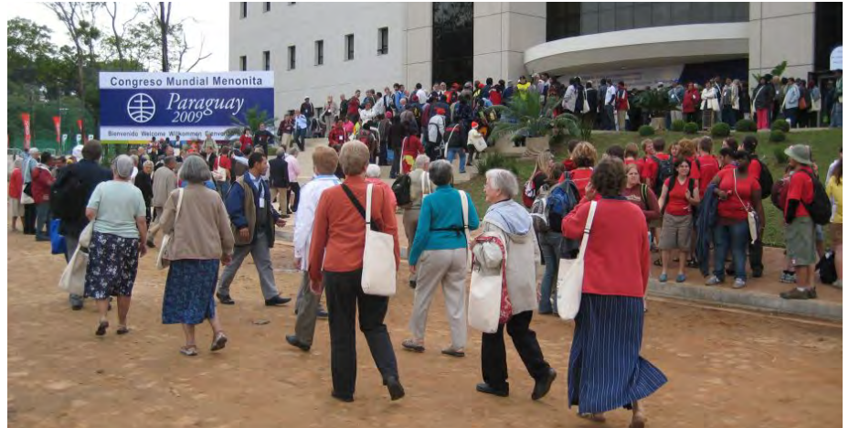
Nearly 6,000 Mennonites from around the world attended Mennonite World Conference 15 in Asunción, Paraguay.

Following worship, assembly volunteers, like the disciples of Jesus, were faced with the task of feed-